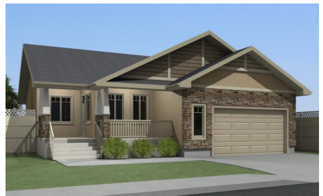
WILLOW RIDGE SERIES ELEVATION