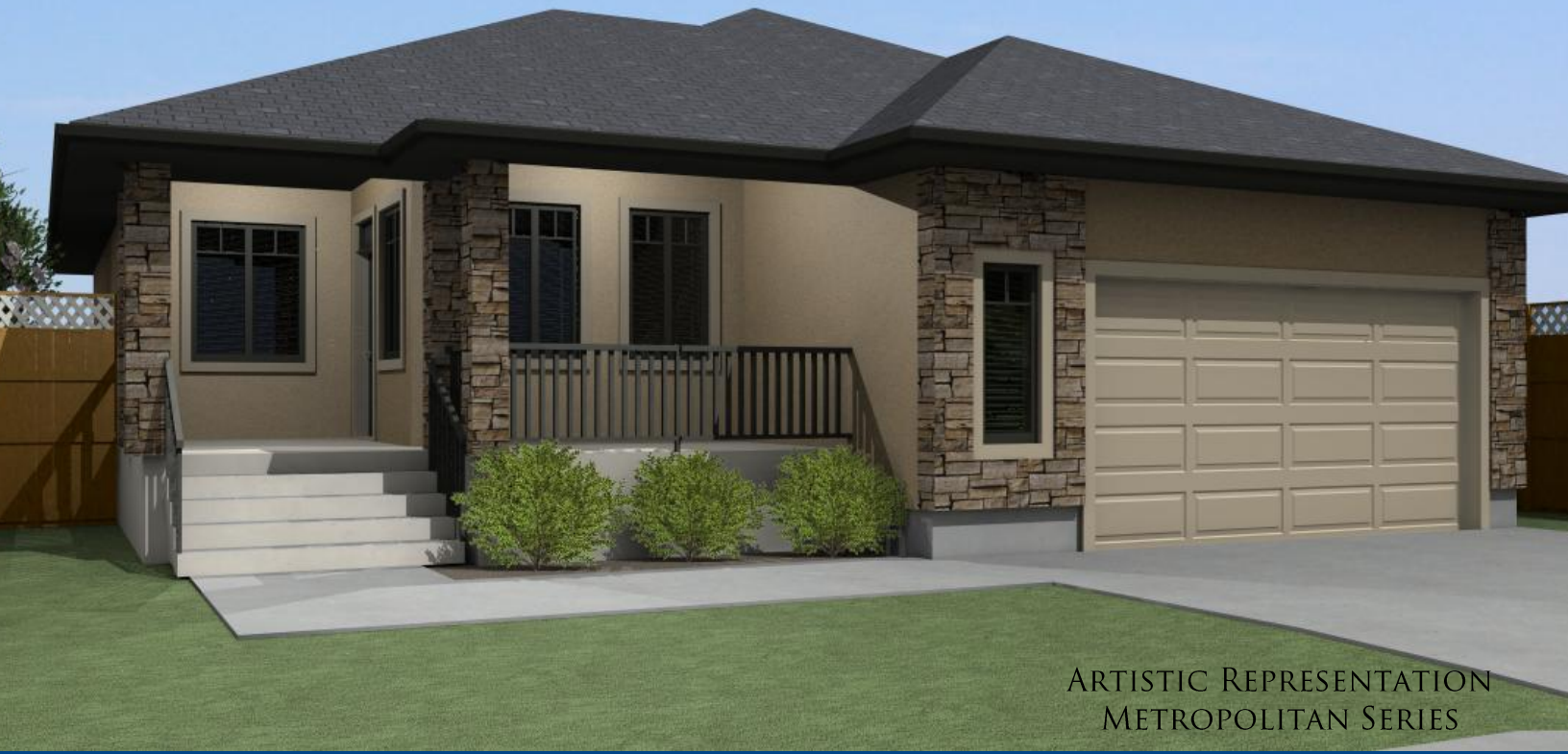
ARTISTIC REPRESENTATION METROPOLITAN SERIES